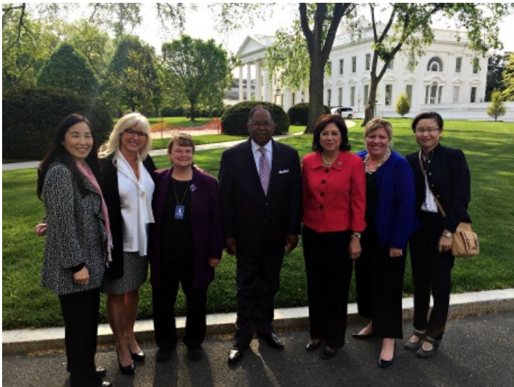
I joined my Board colleagues, staff and County leadership for a meeting at the White House with HUD Secretary Julian Castro and several high ranking Assistants to the President to discuss homelessness, health funding, criminal justice and IT advancements. Really good meeting!